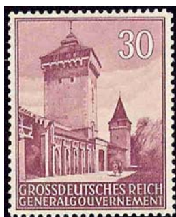
40P2 grey violet

41P2b Yellow orange, (fragment of presentation card) value number 24 instead of 8