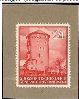
41P2a red orange