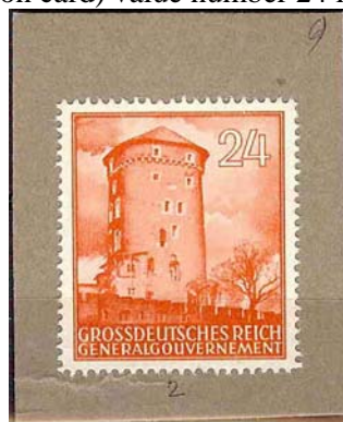
41P2b yellow orange