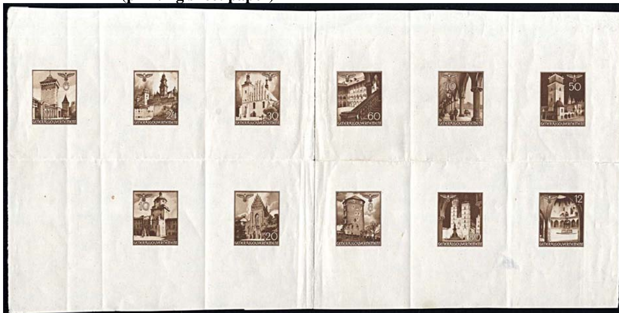
40P1-51P1 Printing proof in brown on gummed stamp paper

40P1-51P1 Imperforate miniature sheet in dark brown on gummed stamp paper (printing sheet paper)