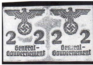
P0 Overprint proof 2 Groschen